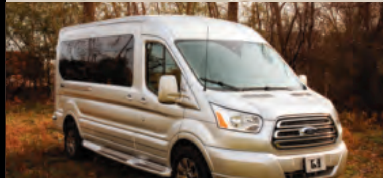
Ford Transit Van