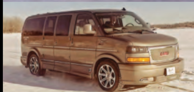
GMC Savana All-Wheel Drive